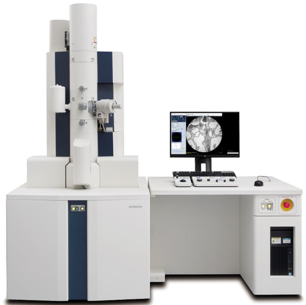
Figure 1 – The ViroTEM system is compact TEM-based analysis tool designed for simple operation but with powerful functionality

The combination of the advanced TEM-system together with VIAS software enables automated 2-level screening which allows the system to determine which grid squares are suitable for imaging and then acquires a series of high-resolution images at a pre-determined number of locations on the grid.